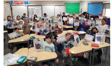
Participants and winners from Allen Elementary School

Chula Vista, CA – Last week Sweetwater Authority (Authority) selected 10 local elementary school students as winners of the “Being Water Wise Is...” Poster Contest. The annual contest is open to K-6 th graders in the Authority’s service area, and encourages the students to think about the importance of water in their everyday lives, and how they can help protect and conserve water in their homes and community.